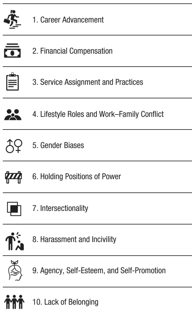
Fig. 1. Ten issues affecting the future of women in psychological science: Issues 1 to 3 involve examples of gender gaps facing women in psychological science. Issues 4 to 10 summarize possible systemic, interpersonal, or intrapersonal mechanisms that may help account for those disparities. This list is not intended to be exhaustive or to be a discussion of all of the relevant issues, or underlying mechanisms, affecting the future of women in psychological science.

or structural factors within the broader culture that affect the different roles that women and men occupy, (b) interpersonal factors that affect the degree to which women's contributions are recognized and respected by others in their field, and (c) intrapersonal factors that shape women's choices and behaviors. We note that challenges occurring at any of these levels are likely to be interrelated. We also recognize that variation is likely to exist within psychology; some departments, programs, societies, and subdisciplines are doing a better job than others at creating a culture of inclusion that has accountability structures in place, fosters norms of supportive interactions, and generally promotes a sense of belonging for women and men alike. Whenever possible, we