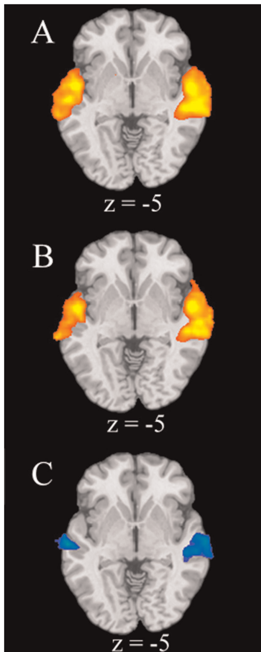
Figure 1. Regional Brain Activations during the Perception of Infant Cries. Axial slices of regional brain activations for a) low-distress cries versus pink noise, b) high-distress cries versus pink noise, c) and high-distress cries versus low-distress cries. Color on T1 template images from SPM5 indicates significant increases (red color) and decreases (blue color) in BOLD signal. The right side of the brain is on the right. The number under each brain image indicates z-axis coordinates of the image in the MNI (Montreal Neurological Institute) template space. The only voxels displayed on the brain images are regions with corrected p < .05 threshold at an uncorrected voxel-level threshold of p < .01 at each tail and a cluster of 45. doi:10.1371/journal.pone.0036270.g001

face contrasts correlated with self-reported measures of behavioral inhibition and activation suggesting that neural responses to infant stimuli vary as a function of motivational approach and avoidance tendencies.